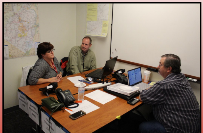
Left: 2018 Functional Exercise. Right: 2017 Full Scale Exercise