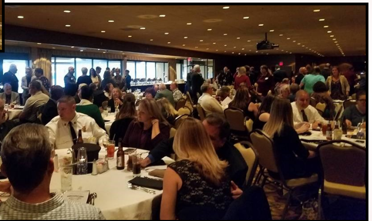
Top: Jefferson County Sheriff's Department at the 2017 First Responders Banquet.